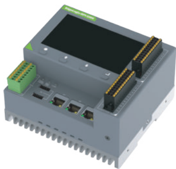
EdgeLogix-RPI-1000 Industrial Controller